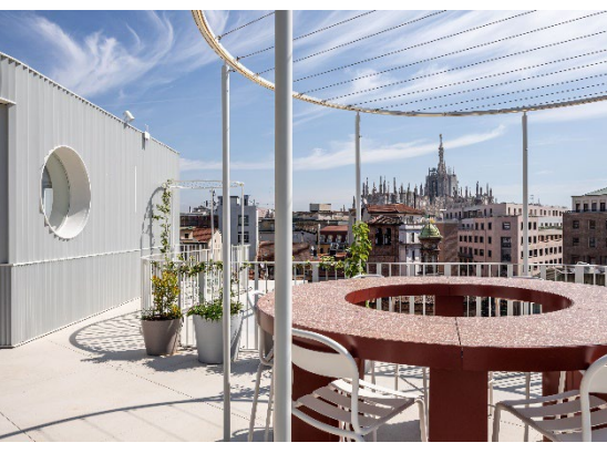
>> Download the visuals <<